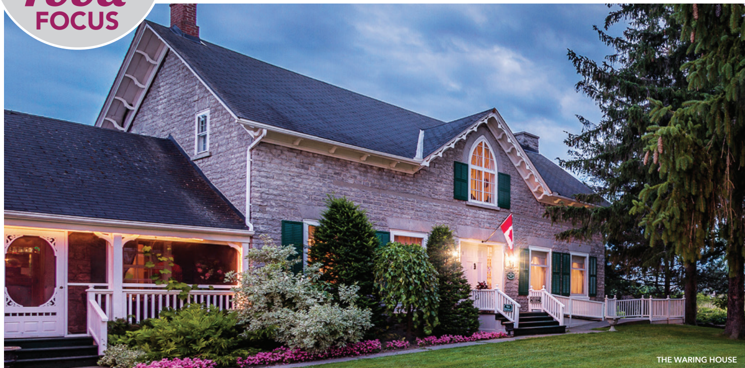
THE WARING HOUSE